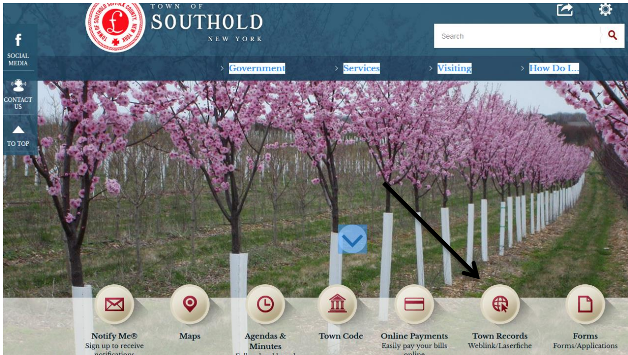
Above: Homepage, Click on Link "Town Records" Weblink/Laserfiche